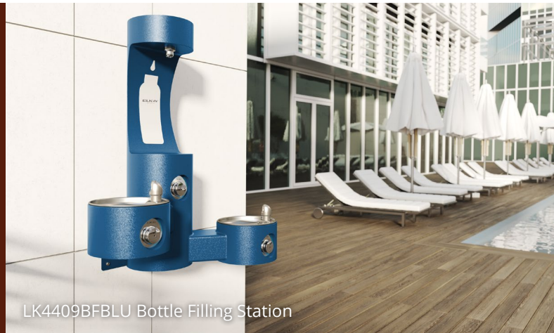
LK4409BFBLU Bottle Filling Station

From bottle filling stations to water coolers and fountains, our filtered and vandal-resistant drinking water products offer the ultimate solution for your hospitality environment.