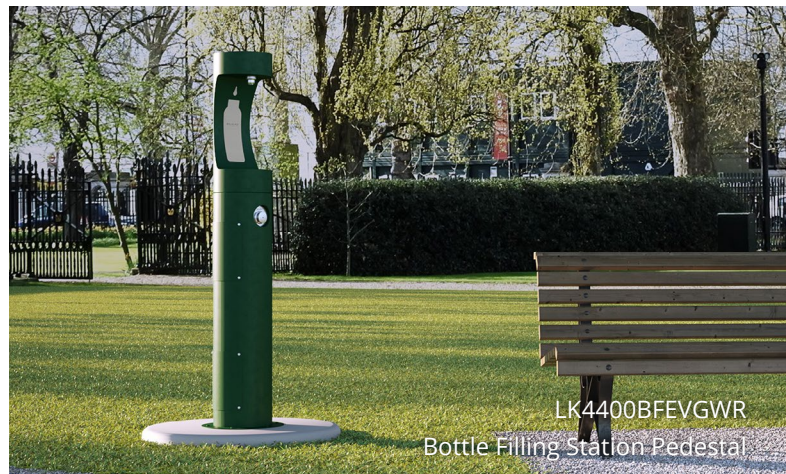
LK4400BFEVGWR Bottle Filling Station Pedestal