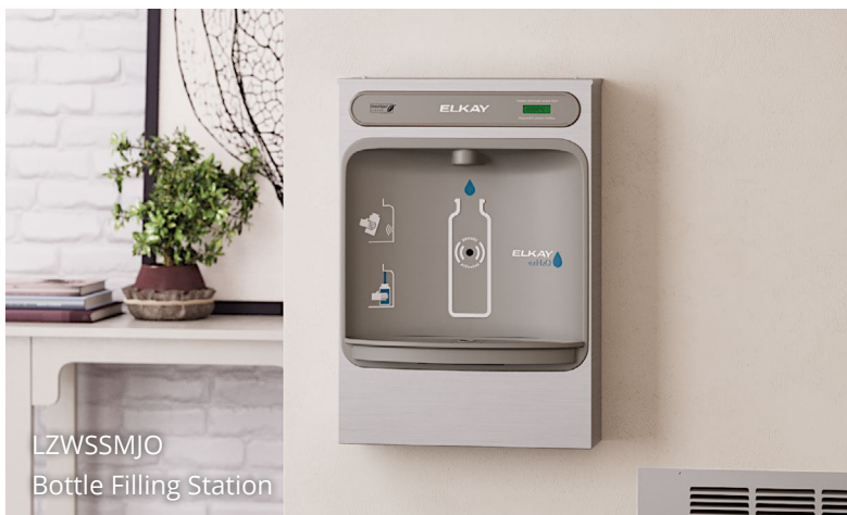
LZWSMJO Bottle Filling Station

Bottom-right: LBWD2C00BKC Liv Pro Water Dispenser